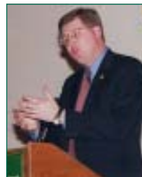
U.S. Rep. Frank Lucas

U.S. Sixth District Congressman Frank Lucas spoke to the general assembly at a luncheon on Monday, expressing confidence that the final version of the new federal Farm Bill will be close to the version recently passed in the U.S. House of Representatives. He stated that a wide variety of groups provided input for the legislation, and he believes the expansion of conservation programs will be included in the final bill. Lucas, who chairs the House Agriculture Subcommittee on Conservation, Credit, Rural Development and Research, was recently named as a conferee on the committee that will work out the differences between House and Senate versions of the Farm Bill.