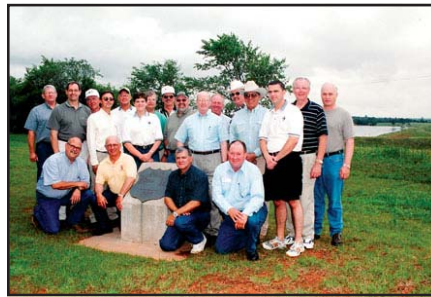
The NACD executive committee and members of Oklahoma's conservation partnership at Bellcow Lake.

The executive committee of the National Association of Conservation Districts met in Oklahoma City June 28 through July 1. With Oklahoma being the national leader in the number of small watershed flood control dams, the Lincoln County Conservation District and the National Watershed Coalition provided the group with a tour in nearby Lincoln County. The group visited Kickapoo Nations Watershed Dam No. 1-M. The dam was built in 1990, creating Bellcow