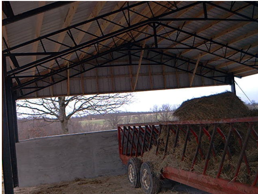
Figure 6. Beef cattle feeding shed.