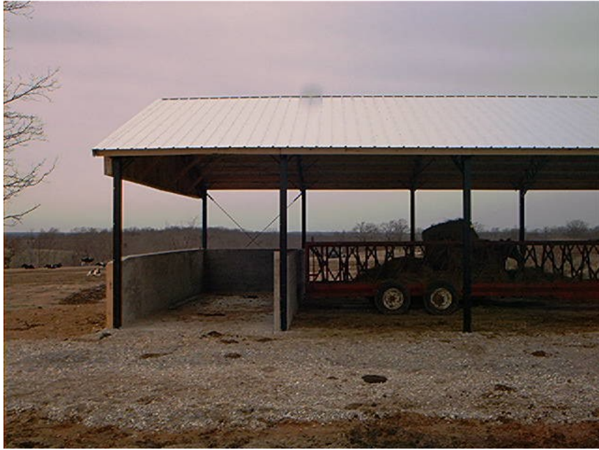
Figure 1: Feeding facility with dry stack.