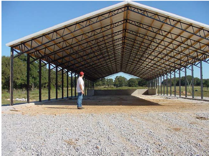
Figure 2. Inside of feeding facility showing dry stack on the end.