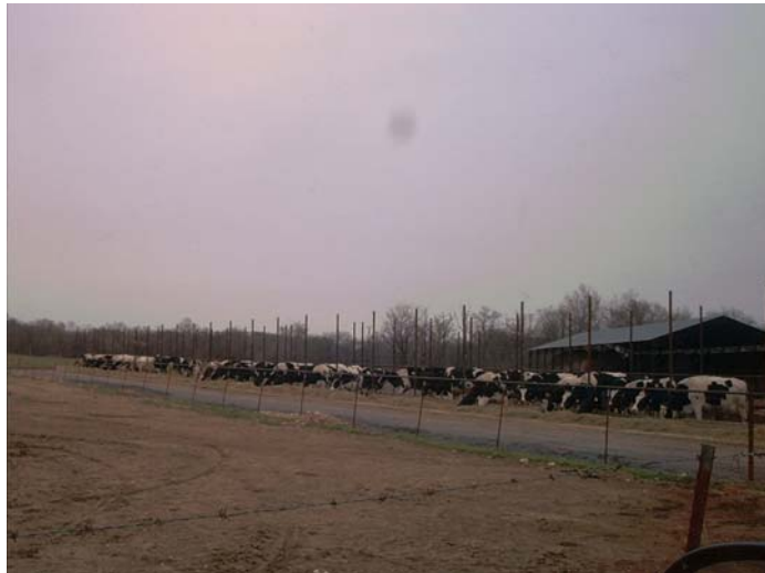
Figure 7. Dairy feeding floor.