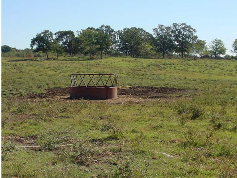
Figure 3. Area exposed to excess waste and erosion. This problem is corrected by building the feeding facilities.