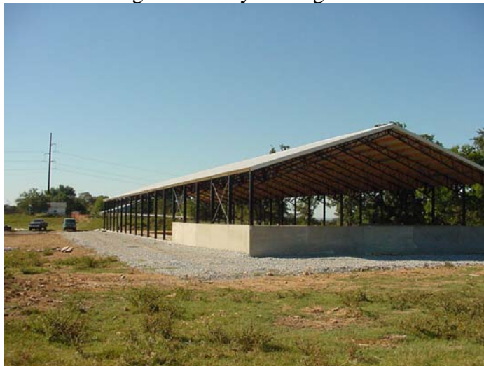
Figure 9. Large dairy feeding facility.