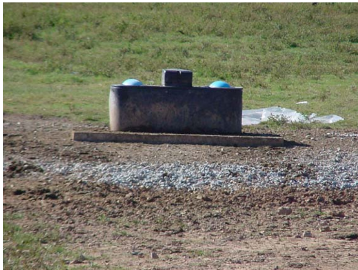
Figure 12. Automatic waterer for large feeding facility.

Cross fencing allows pastures to be grazed on a rotational basis. The pasture is separated into different sections, grazed and then given time to recover before being grazed again. Often, single stranded electric power fences are capable of subdividing pastures. Decreasing section size and increasing the number of grazers yields a more efficient use of pastures. Livestock become less selective in foraging and consume less desirable plants. Overgrazing is prevented by decreasing the time livestock spend in the section. The number of pasture sections depends on the time it takes for the pasture to recover from grazing (Manitoba Agriculture and Food, 2003). Rotating pastures also prevents the build-up of manure in any one area.