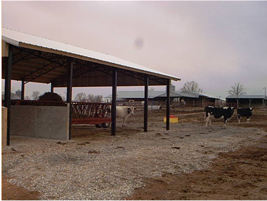
Figure 5. Another view of the beef cattle feeding shed.