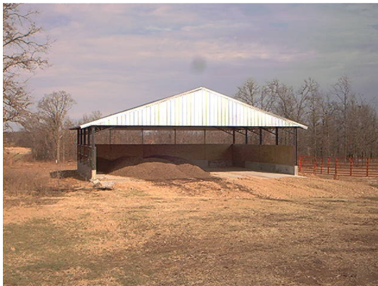
Figure 10: Poultry waste dry stack.

When exposed, poultry litter will lose nitrogen to the air as ammonium. Exposed litter is also vulnerable to runoff events after rainfall. This subjects both groundwater and surface water to pollution. Proper storage ensures that the fertilizer applied to land has improved nutrient retention, as the litter will not have been as exposed to the elements. Leaching of nutrients into ground water can be hindered by use of a ground liner; however, a permanent structure built to contain dry litter is often a better storage choice. These buildings usually have roofs and concrete floors to protect the litter from the elements in addition to protecting groundwater from nutrient leaching (Figure 10). The height of the roof is important, as it should offer enough space for litter to be piled and the equipment to be used. Partial walls may enclose the structure to prevent wind and rain from having an impact on the litter. Interior posts should be avoided as they impede activity in storing and removing the litter (Cunningham et al., 2003).