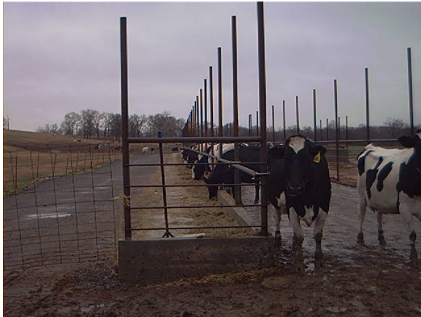
Figure 11. Dairy feeding facility with auto waterer and travelways from pasture to milking parlor.