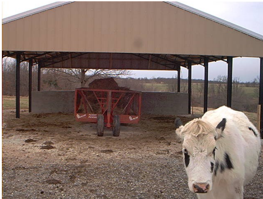
Figure 4. Beef cattle feeding shed.